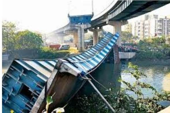
Fig. 1: 'Abridged' Fly-overs: The Ultadanga flyover in North Kolkata

expertise and equipment. Consequently, the said section of the city now appears like Patwardhan's paintings and demonstrates the total lack of overall planning. This incident also triggered the temporary stalling of bridge building in Kolkata, thereby producing a crisscross of unfinished bridges.