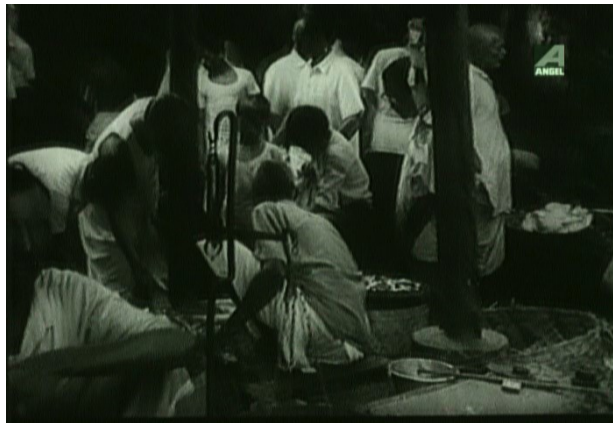
Fig. 4: The city bazaar in Interview (1970). DVD image

Nevertheless, while there are a range of historical studies on 19 th Century Kolkata, enquiries into the political history of Kolkata from the partition years to the political upheavals of the late sixties and early seventies are rare and far between, 51 and are conspicuous by their absence. In this context, cinema becomes an important visual evidence of the changing cityscapes. For instance, Chinnamul ( Rootless , Nimai Ghosh, 1951) was the sole cinematic document of partition and immigration. Likewise, filmmaker Ritwik Ghatak in his essay on 'Film Making' laments about the 'lost landscape', and the 'lost faces' and the 'lost language'. 52 Furthermore, in Mrinal Sen's films, this post-colonial, the post-partition ravaged city, with refugees, beggars, street dogs, footpaths, dustbins, hi-drains etc., re-emerge with much verve. Indeed, the beginning of Sen's Interview (1970) shows these emergent spaces; alternatively, in Calcutta 71 (1972), the young political activist chased by the police is shown running through the excessively narrow Kolkata by lanes (such lanes are fatefully named 'Serpentine Lanes').