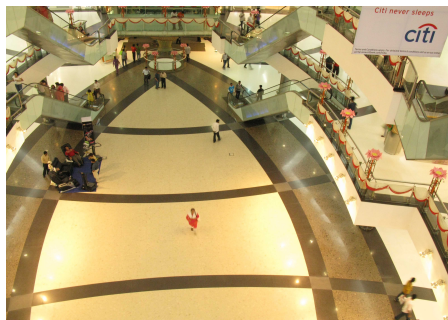
Fig. 5: The mall façade and the ship like protruding structure, photograph by the author.