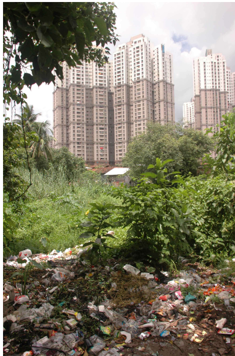
Fig. 11: The other side of development