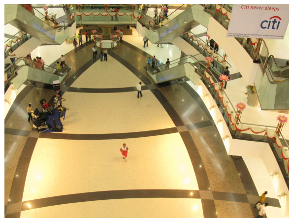
Fig. 9: The Mall and its deck like interior.