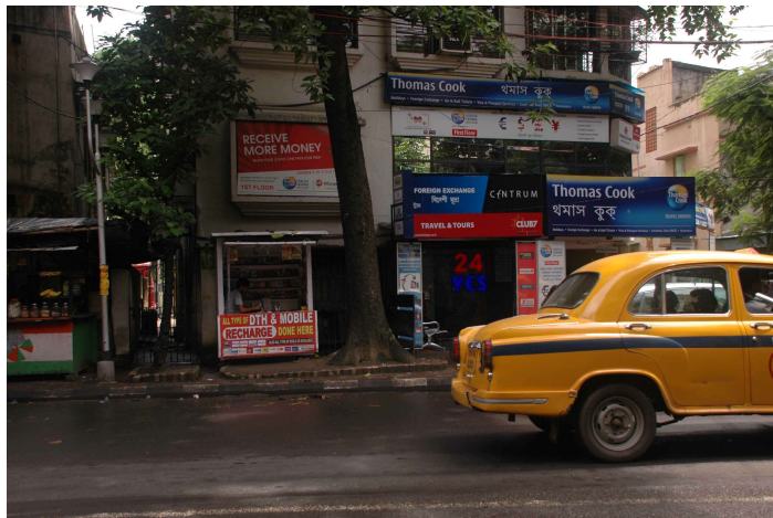
Fig. 6: '24 hours Foreign Exchange' and Local shops.

The 'South-City', has been described as a city within the city. At the gate of the colossal structure is the shopping mall, with an awe-inspiring façade. Built on 31-acres of land, the 35-storeyed residential buildings (with high-speed elevators) are the tallest buildings in the city (and eastern India). Technical innovations like the use of shear walls instead of columns were required for such tall buildings because of the soil quality of the city. 57 Opposite this South-City, is a predominantly Hindu middle class locality (namely Jodhpur Park), and a little further there is a Hospital. On South-City's left there is the slum-area, which comprises largely Muslims. Further down, there is a College, a single theatre, a flyover (towards the city's largest Lake), a Mosque and beyond that a cemetery. In fact, the Mosque structure, Gulam Muhammed Shah Mosque built in 1830s, and the cemetery ground is within half a kilometre of South-City. The near-by slums, named Masjid Para and Rajendra Prasad colony (after India's first President), occupy the crowded main streets (which are usually jammed during Saturdays and Sundays) along with its adjacent areas, and use it for bathing and washing, and thus, in the process highlight the deep ruptures within our social changes. 58