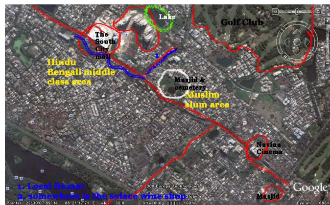
Fig. 2: Google map indicating the South City and its adjacent area