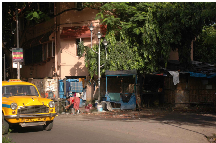
Fig. 7: Masjid-para slum area on Prince Anwar Shah Road, photograph by the author.