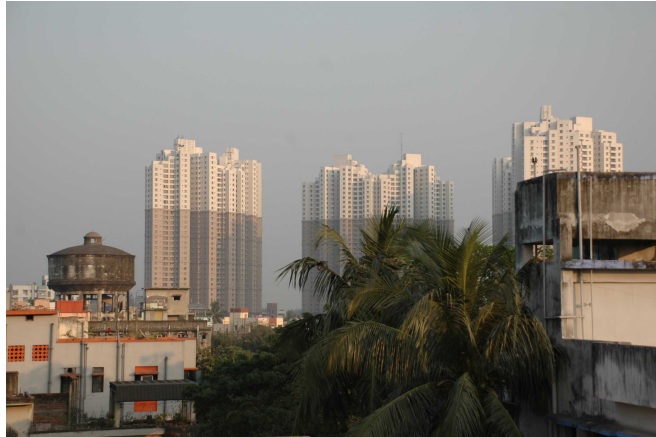
Fig. 10: South-City Housing Complex