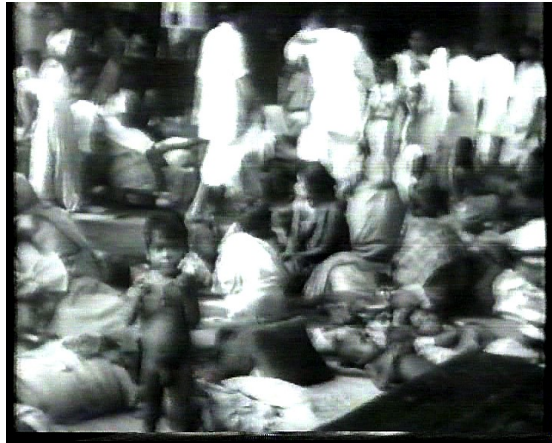
Fig. 3: Chinnamul (1951) and the uncanny image of the refugee. DVD image.

1977, when the Left Front Government eventually came to power in Bengal, these 'colonies' became a stronghold of Left and radical politics.