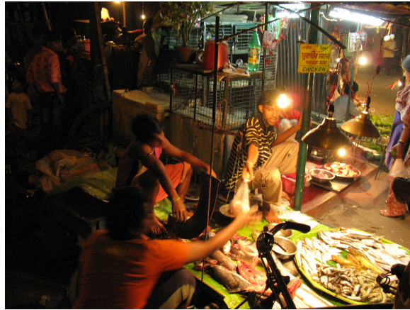
Fig. 12. The neighbourhood fish- market, photograph by the author

and vibrant popular and sub-cultures, and seem to replicate the frenzied vivacity and spontaneity of (Hindu festivals like) Durga Puja or the (Islamic) Eid . 61