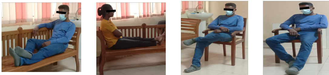
(b) Relaxing State