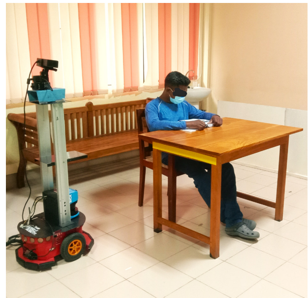
Figure 3: MI Rob observing the user and user behaviour before starting any interactions.

A task-oriented conversation management system employs an innovative approach, utilizing Hierarchical State Transition Networks (HSTNs) along with a state-switching algorithm to dynam-