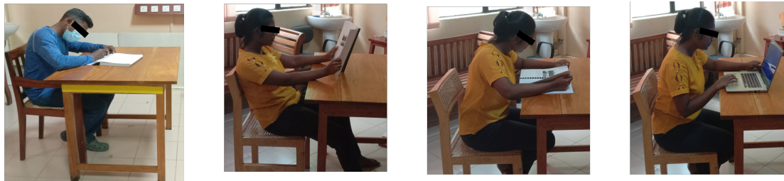
(a) Working State