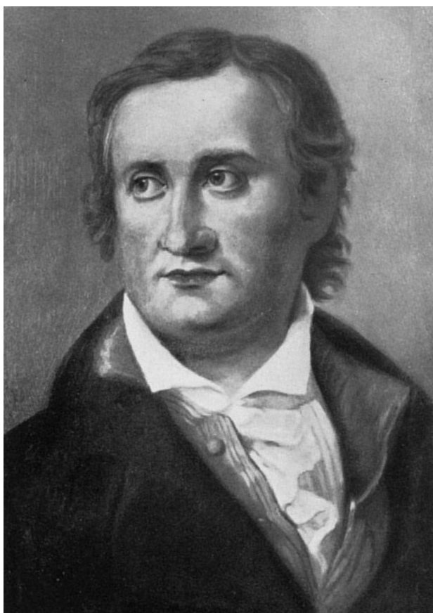
Figure 1: Thomas Seebeck

In 1821, the German physicist Thomas Seebeck made a groundbreaking discovery that revealed the direct conversion of heat energy into electricity. He did so by bringing two different metals together and holding one end heated and the other end cooled. This process is famously known as the Seebeck effect. William Thomson, a British physicist later known as Lord Kelvin, further developed the concept of thermoelectric circuits and introduced the idea of a temperature-dependent voltage in a circuit made of two dissimilar metals. Lord Kelvin's contribution to the field of thermoelectricity paved the way for various applications in temperature sensors, power generators, refrigeration, and cooling systems.