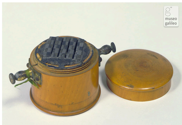
Figure 2: An early thermoelectric generator design in 1829

kept at the minimum. On the contrary, generating electricity from heat energy is a complex and challenging process. This is where thermoelectric materials shine, as they possess the unique ability of converting disordered heat energy directly into electricity without the need for moving parts. These materials have immense potential of capturing the energy in waste heat of various sources like industries, automobiles, and households while providing a perpetual source of energy for wearable devices and biomedical equipment.