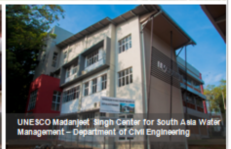
UNESCO Madanjeet Singh Center for South Asia Water Management – Department of CIVIL Engineering