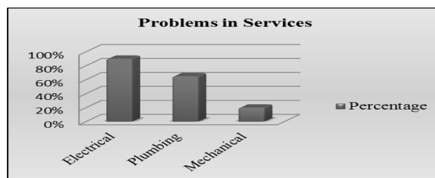
Figure 4.1: Problems in Services Installation

It was revealed that around 42% of the houses were constructed with less provisions in services integration at the initial stage. Later on as time dictates and as need arises it was planned to expand the number of rooms, bathroom, and other amenities which in turn requisite the need of new types of services integration according to the requirement. It was identified that the problems regarding Electrical services is being the most significant issue, statistically it is around 90%. Plumbing problems were identified as the second leading problem, statistically proved as 65% and the Mechanical problems were identified as the least types of problem and it contributes around only 20% among all aspects while its integration had been reported at a very low level in small sector housing construction. According to the questionnaire survey, it was identified that electrical problems are being the worst followed by plumbing and mechanical problems. Figure 4.1 graphically shows the percentages for problems in each service according to the house owner’s perspective.