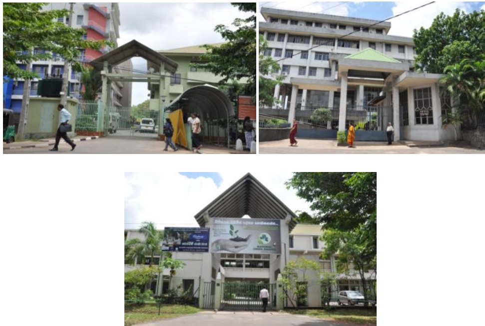
Figure 18: institutional gate and porch entrances

Again, these types of entrances are not commonly found since entrances into institutions are at a wider scale and therefore it is not practical to have a porch inside.