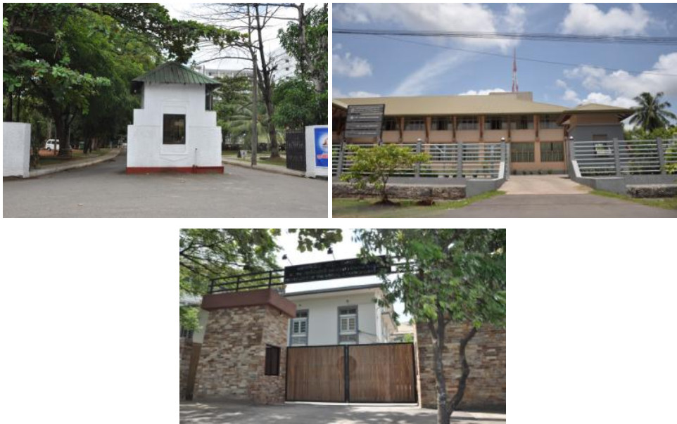
Figure 19: Institutional tower gates