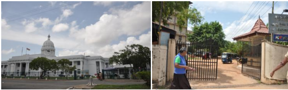
Figure 14: older institutional entrances