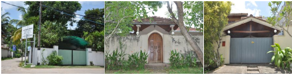
Figure 13: domestic gate and porch entrances