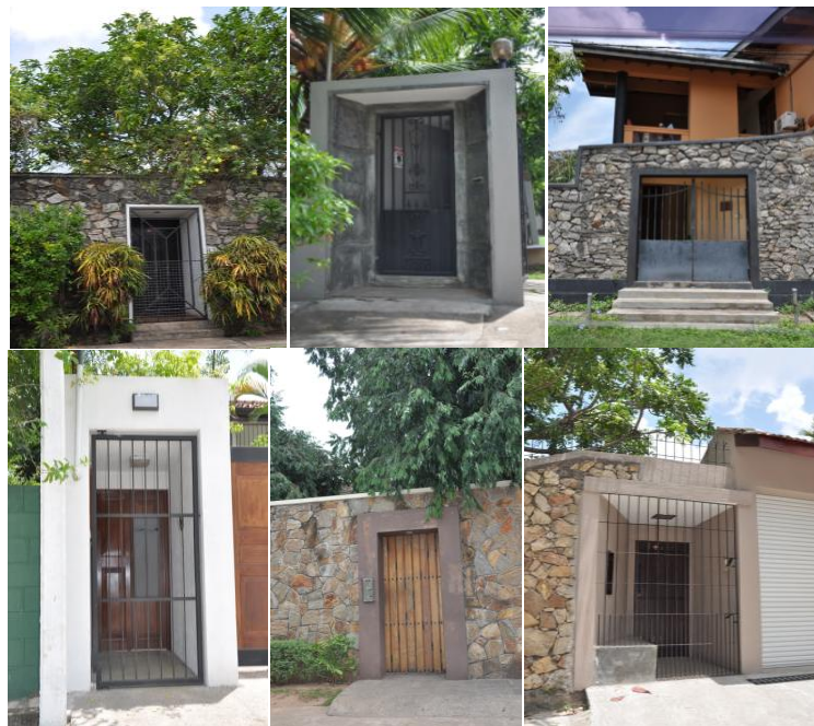
Figure 11: domestic framed entrances

framed within the boundary wall. Sometimes the smaller entrance is recessed with a steel grill gate and timer door.