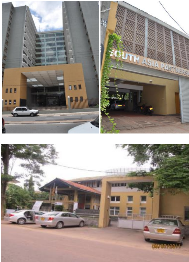
Figure 16: Institutional framed entrances

Framed entrances are the commonly used to give dominance to the entrance.