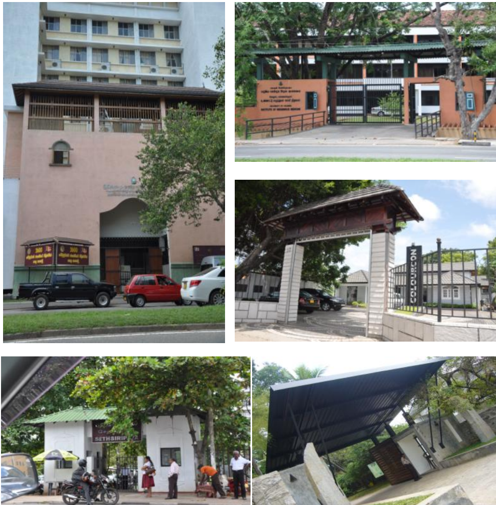
Figure 15: Institutional roofed entrances

Roofed entrances are done at a larger scale and with varying styles. In many instances, other services are also included within the gatehouse complex.