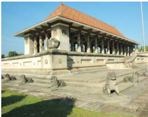
Fig.5: Imposed regionalism: Independence Square, Colombo, Sri Lanka

In a broader sense regionalism could be achieved in two different ways; 'imposed regionalism' and 'authentic regionalism'. Imposed regionalism is achieved through the direct imitation of historic/traditional elements and building forms (replicas). In Sri Lanka, soon after independence in 1948, nationalistic movements gave birth to a style called, 'pseudo-traditional style'. The buildings that emerged from this trend were replicas of historical buildings and reflected imposed regionalism. Independence Square in Colombo, Sri Lanka which is a concrete replica of the Kandyan Audience hall constructed during the 14 th century B.C. is a fine example of such imposed regionalism.