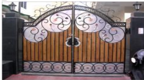
Fig. 8: Lakshmigiri, Alfred house estate, Colombo.

and Buckingham palace, London