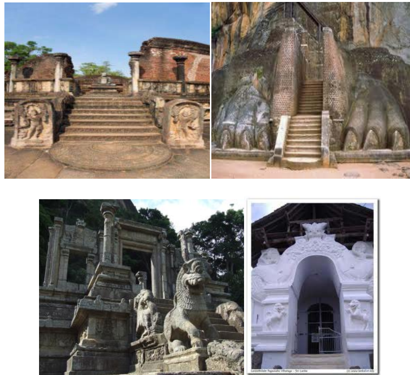
Fig.6: (clockwise) Polonnaruwa Vatadage (11 th C.AD), Sigiriya rock fortress (5 th C.AD), Lankathilake vihara (14 th C.AD), Yapahuwa fortress (12 th C.AD).

Eastern cultures seem to place a greater emphasis on entrances with deep philosophical meanings, than in western cultures. Ancient Sri Lankan entrances are fine examples of this emphasis.