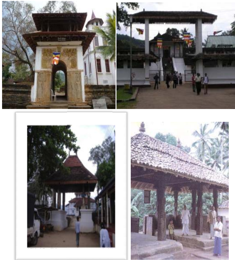
Fig.7: Entrance gate houses with roofs : (Clockwise) Natha Devale-Kandy(13 th C.AD), Maha Saman Devale-Rathnapura(13 th C.AD), Ambakke Devale-Kandy (14 th C.AD),Lankathilake Vihara-Kandy(14 th C.AD).

prominent element in tropical climatic regions as it provides protection from harsh weather conditions such as sun, glare and rain. Therefore a roof at the entrance to a building or a building complex provides physical and psychological comfort and reflects hospitality towards the user. Most entrances with roofs are spacious structures that provide users with other facilities such as seating. These entrances are commonly referred to as ‘gate houses’.