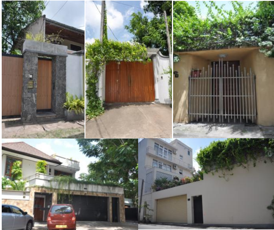
Figure 12: domestic planted entrances

This is an entrance where the roof is planted with flowering plants. Sometimes even pots are kept on top of the entrance. The most commonly found type is the framed entrance with flowers on top.