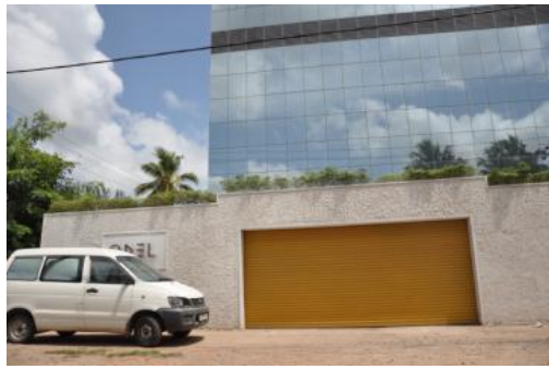
Figure 17: Institutional planted entrances