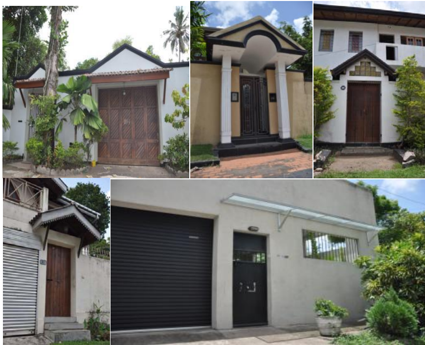
Figure 10: domestic roofed entrances