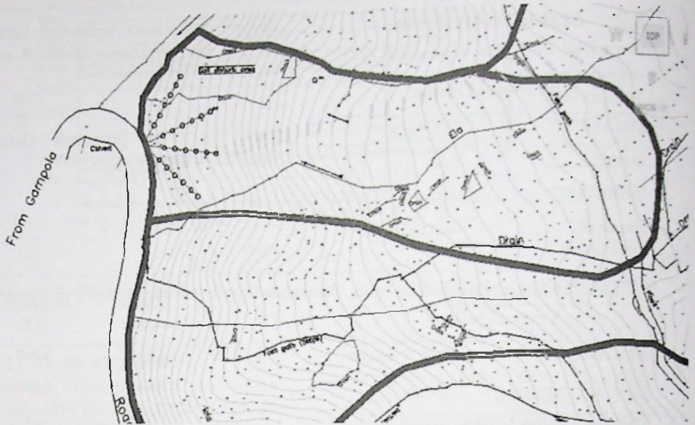
Figure 2: Proposed Design horizontal drain network in conjunction with a series of sand and gravel filled vertical holes capped with 100cm thick clay laver

Landslide monitoring data from extensometers and inclinometers