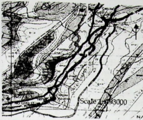
Figure 4. Mineralization of the area