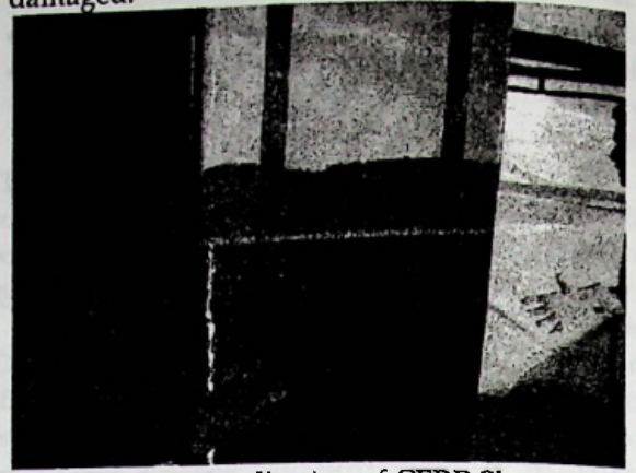
Figure 4: Application of CFRP Sheets

as otherwise the fibres in the sheet might be damaged.