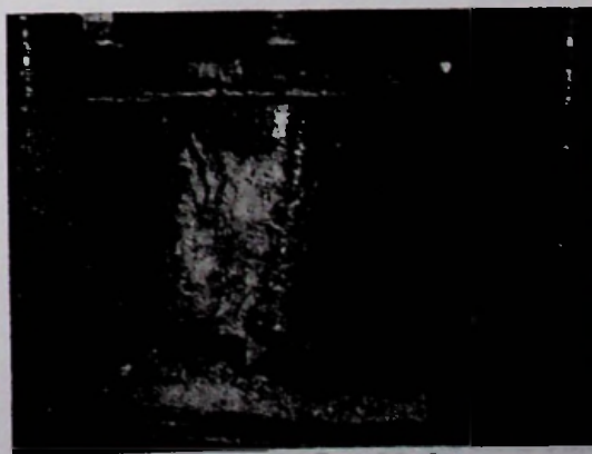
Figure 3: Failure Mode

The Figure 3 shows the failure pattern of a test specimen.