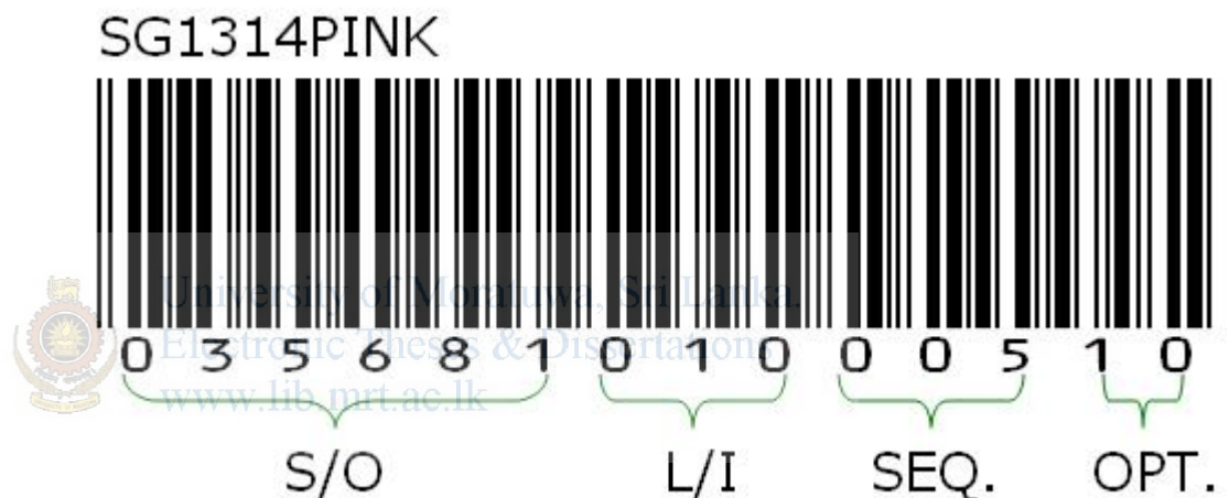
Figure 4.3 Line In barcode format

Barcode sticker is required in Line In operation. It will be using to confirm Line In operation. In the Contourline, there bundle guide will be a combination of sales order, line item and a sequence no. In the barcode sticker in addition to that it will display the operation (10) which it's using to be confirmed. Figure 4.3 displays sample barcode.