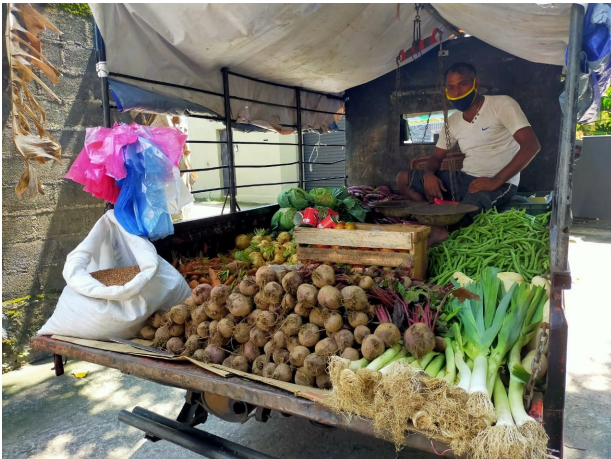
Home Visits: Mobile Vegetable Vendors from Upcountry Nuwaraeliya