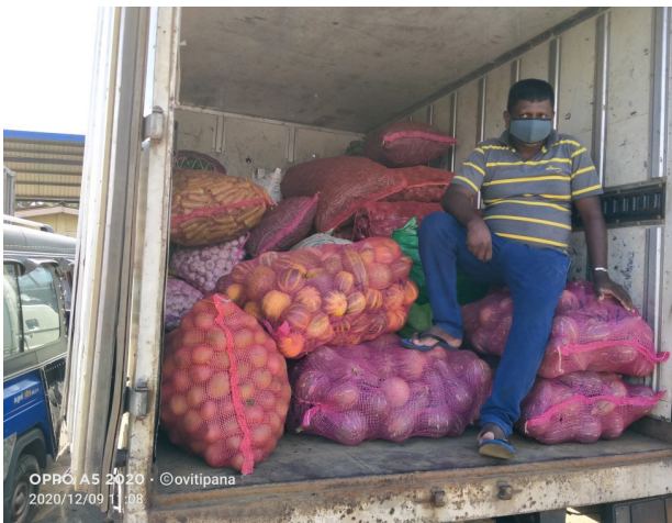
Dambulla Economic Center – wholesale vendor about to transport purchase to Colombo

▼ Bad transportation - one of the root causes of post-harvest damage