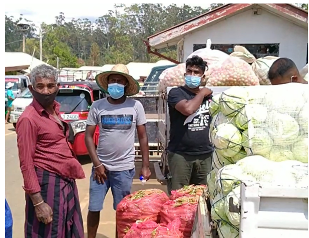
Commission Broker (In the middle of the picture) at Keppetipola Economic Center

▼ Key Player in UFS discussion – Price fixing by commission broker damage