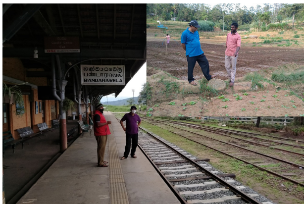
Co-Author interview commercial farmer in Welimada & explore the solutions for vegetable logistics in Bandarawela

Colombo Municipality Region (CMR) consists of a highly complex food system that relies on the supply from distant outstations which literally collapsed during the pandemic situation. A requirement exists for empirical research to derive guidelines and recommendations to increase the sustainability and security in the food supply in CMR during a disaster situation.