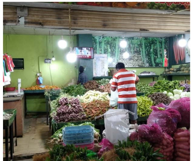
Retail business switching to wholesale model

▼ Bad transportation - one of the root causes of post-harvest damage