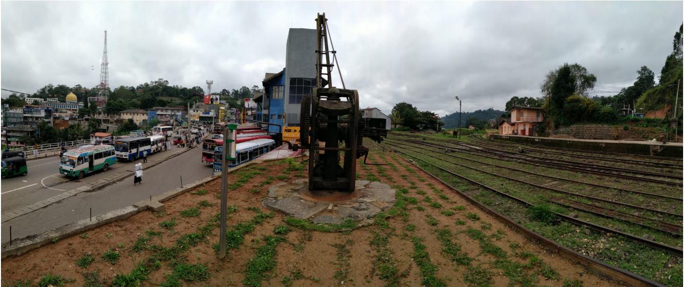
Abandoned logistic hub in Bandarawela linking road & railway network