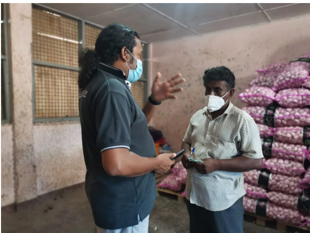
Author Interview a wholesale trader in Dambulla Economic Centre