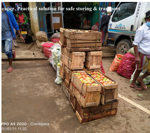
Cheaper, practical solution for safe storing & transport