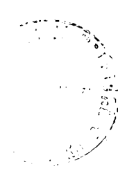
Figure. 3.54 community center